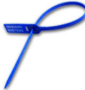
Long Strap Seals